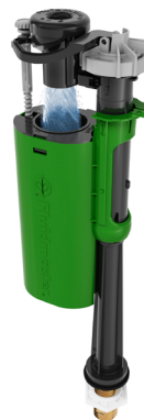
Airgap 6000 Delayed fill bottom entry