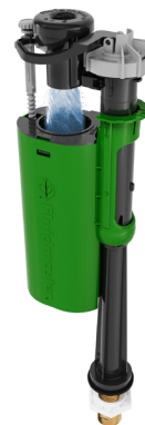
Airgap 6000 delayed fill bottom entry