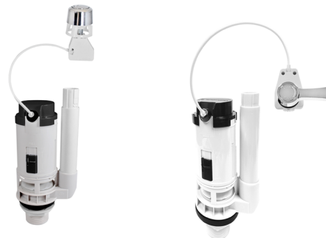
750 Lever Action Cable Dual Flush Valve