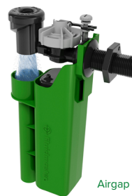
Airgap 6000 delayed fill side entry

One solution is to install a Fluidmaster regulated fill valve (like the Airgap 6000) to slow down the incoming water. Reducing the speed of water intake can often stop the banging noise occurring.